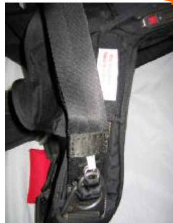
Typ 8 Mainriser: